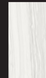
24"x48" Rectified Edge