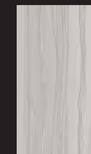
24"x48" Rectified Edge