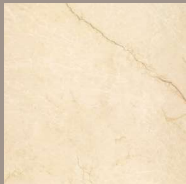
Mitral Brillo (Glossy) RECTIFIED EDGE 24" x 24"