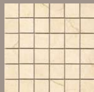
2x2 Mosaic Mitral Natural (12"x12" Sheet)