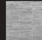
1.5"x 3" Mosaic (12"x 12" Sheet)