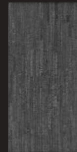
NERO - 12"x 24" PEI IV