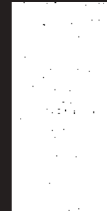
AVORIO - 12"x 24" PEI V