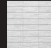
1.5"x 3" Mosaic (12"x 12" Sheet)