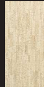
BEIGE - 12"x 24" PEI V