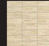
1.5"x 3" Mosaic (12"x 12" Sheet)