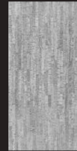
GRIGIO - 12"x 24" PEI V